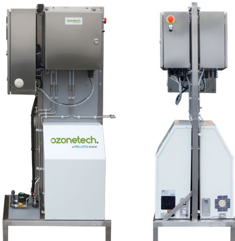
Ozone system based on Rena PRO.

High performance ozone system with capacity to sanitize large scale industrial buildings, fast and efficient. Automation & control on HMI to easily configure a treatment cycle.