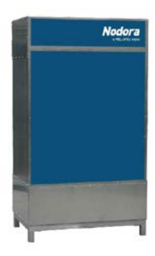
Odors to remove or emissions to treat?

The combination of a compact design and industrial grade, high-performance odor treatment enables new options for planners and consultants. Odorous off-gas can be released in underground parking garages and court yards, making ductwork less costly and cumbersome.