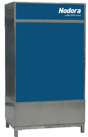
Odors to remove or emissions to treat?

The combination of a compact design and industrial grade, high-performance odor treatment enables new options for planners and consultants. Odorous off-gas can be released in underground parking garages and court yards, making ductwork less costly and cumbersome.