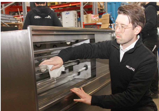
The Aurora UV system lines are design with superior maintenance flexibility and parts replacement.

Elektravägen 53 SE-126 30 Hägersten, Sweden +46 10 252 30 00 www.mellifiq.com