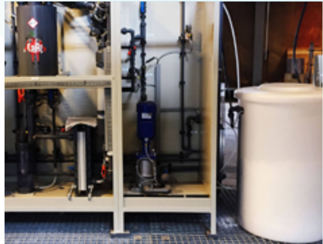
The chlorine is added to the clean water tank to limit the growth of unwanted microorganisms throughout the culture.

The clean water tank is supplied with chlorine and nutrients. The function of the chlorine is to maintain the purity of the water by minimizing the growth of microorganisms. To be able to supply the right amount of chlorine, the chlorine content in the outgoing water is measured continuously. The amount of chlorine added has decreased by 80-90 % as a result of the upstream ozone treatment.