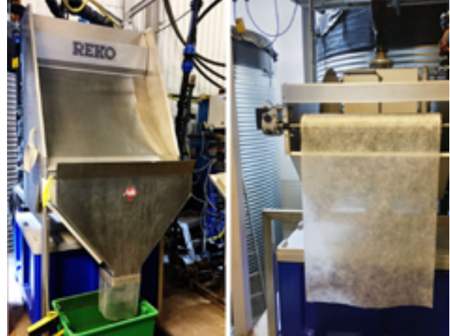
Large particles are removed with a static arc filter and a fleece filter.