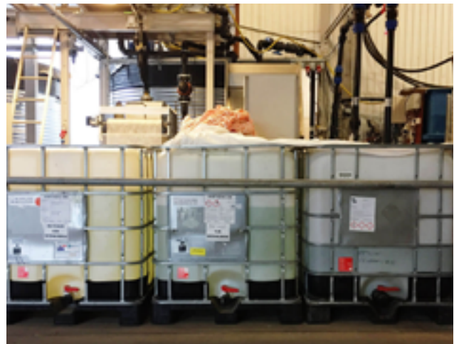
Nutrients are added to the treated water. The amount of nutrients is adjusted based on continuous measurement of the levels in the outgoing water.

The water for cultivation needs to be supplied with nutrients in the quantities required by the bulbs and tulips. Therefore, the outgoing water from the clean water tank is continuously analyzed to ensure that the right amount of nutrients is added. With ozonation, the nutrients are not effected negative by any contaminants in the circulating water.