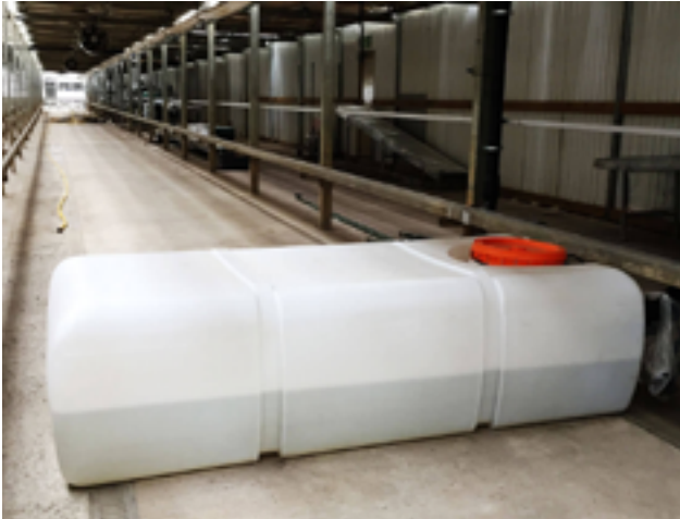
Collection of drainage water.

reduced by 50-80 %. Another great advantage is that it is possible to grow more with lower footprint. The volume can be more than doubled. A third advantage is that procurement and transports decrease.