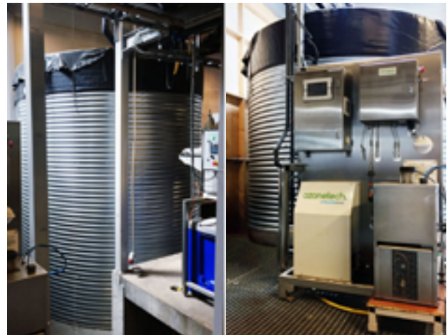
Ozone purification takes place in the drainage tank (40m 3 ). The redox value is continuously measured and controls the amount of ozone. The RENA Vivo ozone system produces ozone of the oxygen in the ambient air. The clean water is collected in a clean water tank (40m 3 ) for distribution.

The reclaimed water from the cultivation is treated with and purified by ozone. The ozone is produced onsite by the oxygen in the surrounding air. The ozone is then dissolved in water which is continuously fed to the drainage tank where the treatment takes place, in a circulating system. The treated water is then returned to ozonation again. The purified water in the drainage tank is continuously transferred to the clean water tank. To ensure the high degree of treatment, the redox potential is measured continuously.